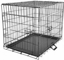
Pet Folding Crate – medium ($42.00)