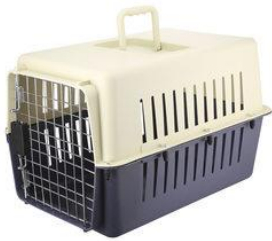
Pet Carrier ($20.00)