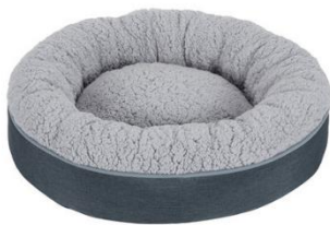
Pet bed round Plush – medium ($14.00)

- I only suggest this, if you do not have a safe, suitable area while you have a puppy for indoor and outdoor use.