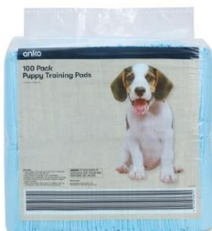
100 Pack Puppy Training Pads ($20.00)

- I suggest three (I PROVIDE ONE BED FOR YOU), one in your lounge room, one in the crate and one spare for when one is in the wash.